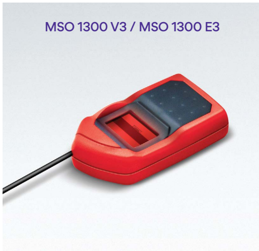
MSO 1300 V3 / MSO 1300 E3