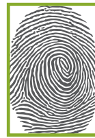
MSO 1300 Series capture